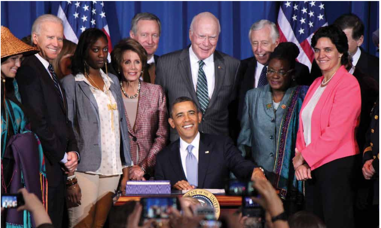
President Barack Obama signs the Violence Against Women Reauthorization Act, Thursday, March 7, 2013.

Several accomplishments are detailed on the next page.